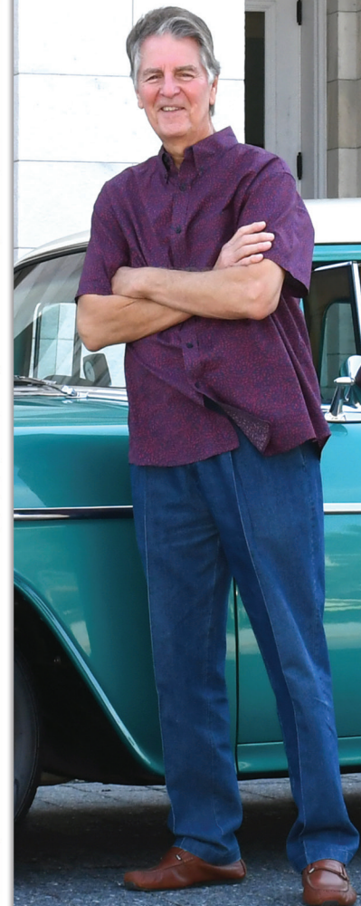
Mayor Andrew “FoFo” Gilich