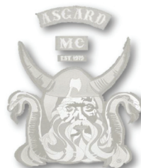
Asgard Motorcycle Club