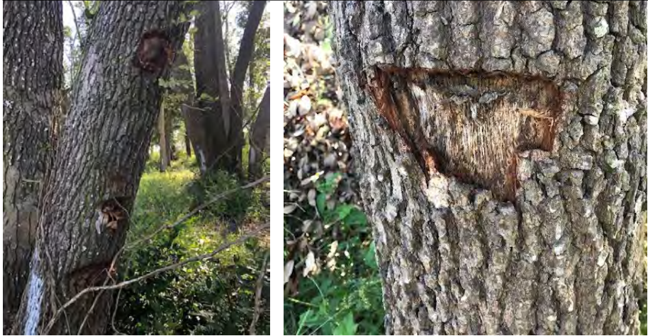
Evidence of inaccurate tree survey Left: 30” Live Oak, labeled as 14” Water Oak (proposed for removal). Right: 52” Live Oak labeled as 34” Live Oak (proposed to remain). NOTE: Compare to 17” wide paper in the photo)