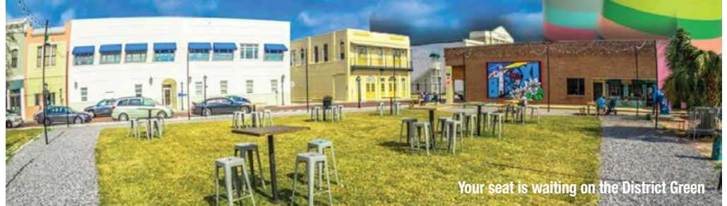
Your seat is waiting on the District Green

The Mental Health Association of South Mississippi will host its 14th Annual "Don't Worry be Happy" fundraiser on Friday, July 16 from 7 to 10 p.m. at the Biloxi Civic Center. This year's event will have a Mardi Gras theme and will include live and silent auctions, food tasting and awards presentation. Tickets are $50 a person and benefits those with mental illness and others who want to incorporate prevention measures into their lives. For more information, visit online at msmentalhealth.org/event/dont-worry-be-happy-2021 .