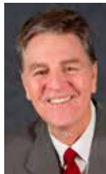
Mayor Andrew "FoFo" Gilich

Many traffic signals and streets light remain inoperative or destroyed,