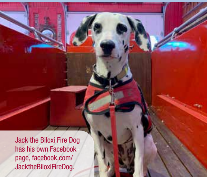
Jack the Biloxi Fire Dog has his own Facebook page, facebook.com/JacktheBiloxiFireDog .