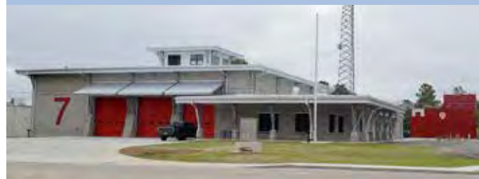
Fire Station 7, the department's first training facility, opened Jan. 11, 2020.