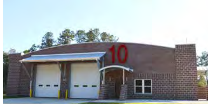
Biloxi Fire Station 10 opened in November 2019.