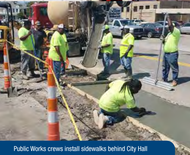
Public Works crews install sidewalks behind City Hall