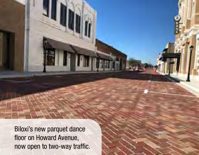
Biloxi's new parquet dance floor on Howard Avenue, now open to two-way traffic.