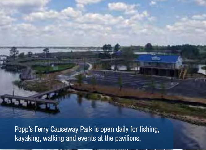
Popp's Ferry Causeway Park is open daily for fishing, kayaking, walking and events at the pavilions.