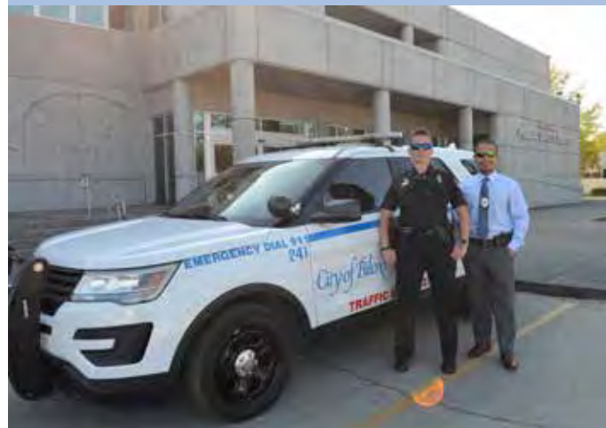
Biloxi police officers responded to over 100,000 calls for service in 2019.