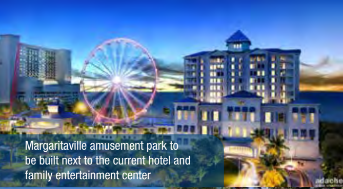
Margaritaville amusement park to be built next to the current hotel and family entertainment center