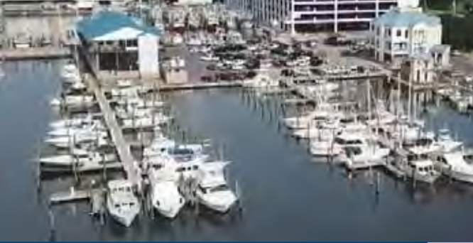
Community crime cameras were installed at the Small Craft Harbor in 2019.