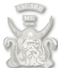
Asgard Motorcycle Club