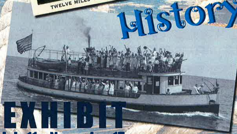
EXHIBIT July 11 - November 15

Cruise with us to the Isle of Caprice! Join us aboard the Capt. Pete Sunday, October 9th • 2-5 pm boarding at Point Cadet Marina Food • Cocktails • Music Guest Speaker • History Talk $50. per person, limited seating, reserve your spot TODAY!