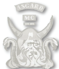
Asgard Motorcycle Club