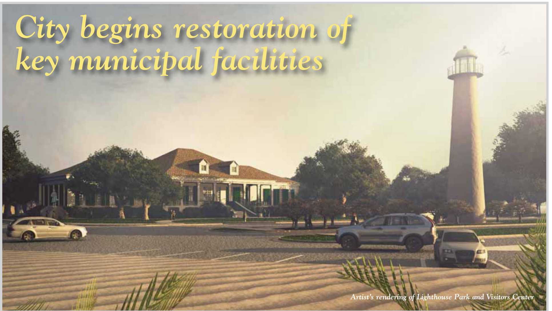
Artist's rendering of Lighthouse Park and Visitors Center

The city has projects either underway or in the works to restore three key municipal facilities: the Visitors Center, the Biloxi City Cemetery and the Biloxi Community Center.