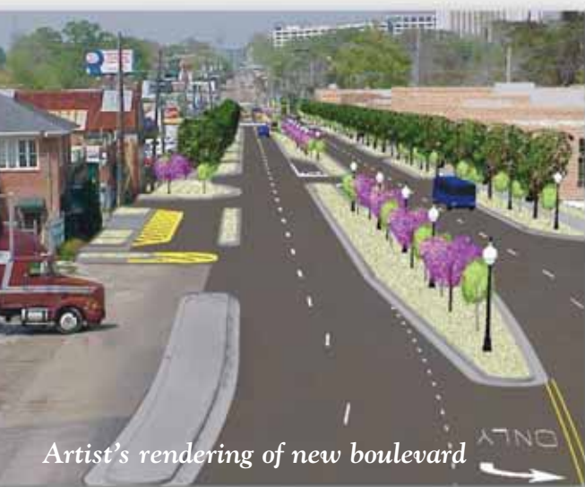
Artist's rendering of new boulevard