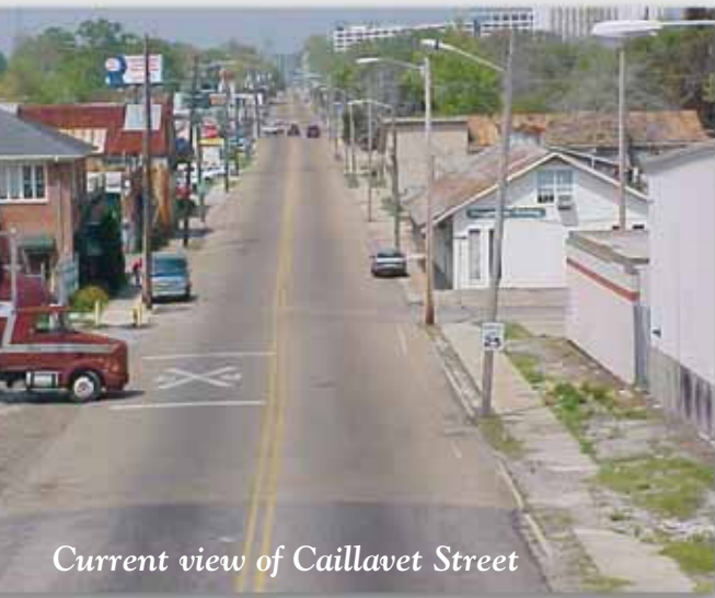
Current view of Caillavet Street

Dear Caillavet Street area property owners and residents: