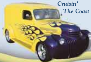
Cruisin' The Coast