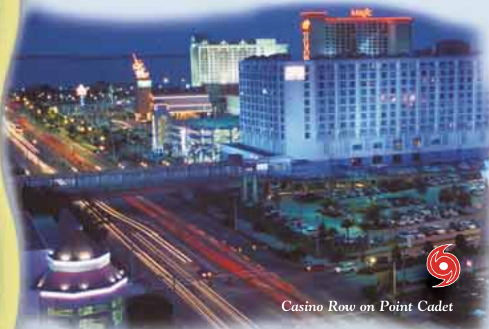
Casino Row on Point Cadet