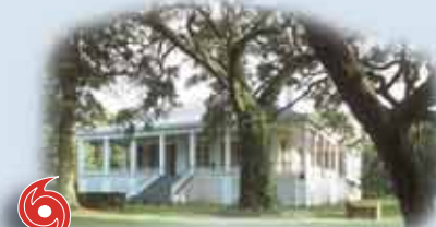
Beauvoir, the Jefferson Davis Home and Presidential Library

Ohr-O'Keefe Museum of Art, downtown Biloxi: Home to the "Mad Potter of Biloxi," this museum houses the world's largest public display of the works of potter George Ohr, an eccentric turn-of-the-century potter whose work has gained national acclaim.