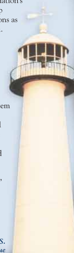
The Biloxi Lighthouse, at U.S. Highway 90 and Porter Avenue