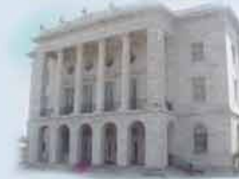
Biloxi City Hall, 140 Laneuse St.

New residents can register to vote at Biloxi City Hall or at the County Courthouse. The nearby County Courthouse also is where you purchase automobile tags or pay city and county property taxes. Mississippi driver's licenses are available from the Mississippi Highway Safety Patrol, in the Dr. Eldon Bolton State Office Building on Back Bay.