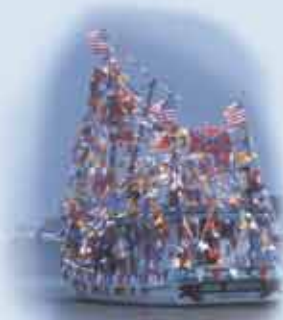
Blessing of the Fleet