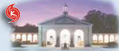
Maritime & Seafood Industry Museum

Maritime and Seafood Industry Museum, Point Cadet: The museum traces Biloxi's rise to "Seafood Capitol of the World," with exhibits that give a visual timeline of Biloxi's history and describe boatbuilding, net making, blacksmithing, and sailmaking. Learn about the destructive force of hurricanes in the Wade Guice Hurricane Room.