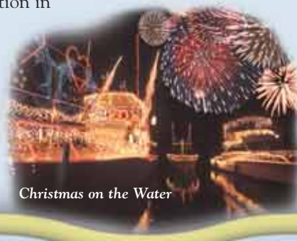
Christmas on the Water