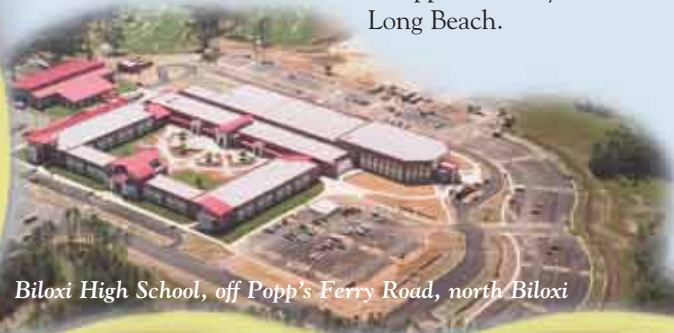
Biloxi High School, off Popp's Ferry Road, north Biloxi