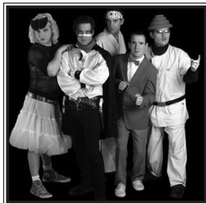
The Molly Ringwalds