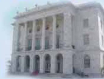
Biloxi City Hall, 140 Laneuse St.

New residents can register to vote at Biloxi City Hall or at the County Courthouse. The nearby County Courthouse also is where you purchase automobile tags or pay city and county property taxes. Mississippi driver's licenses are available from the Mississippi Highway Safety Patrol, in the Dr. Eldon Bolton State Office Building on Back Bay.