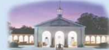
Maritime & Seafood Industry Museum

Mardi Gras Museum , downtown Biloxi: Housed in the historic Magnolia Hotel, the museum features colorful exhibits that tell the story of Mardi Gras in Biloxi, and features costumes including those of the current King d'Iberville and Queen Ixolib (Biloxi spelled backwards).