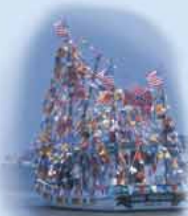
Blessing of the Fleet