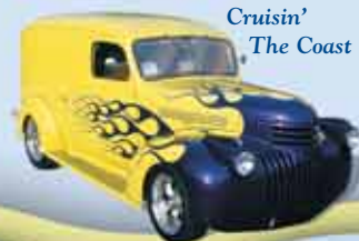
Cruisin' The Coast