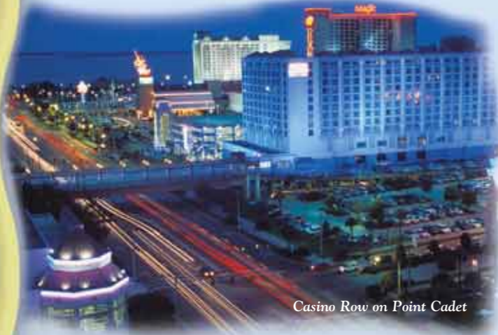
Casino Row on Point Cadet