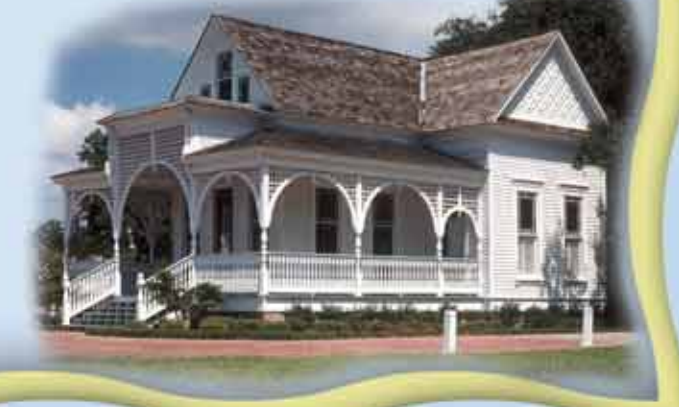
The Biloxi Visitors Center on the Town Green in downtown Biloxi