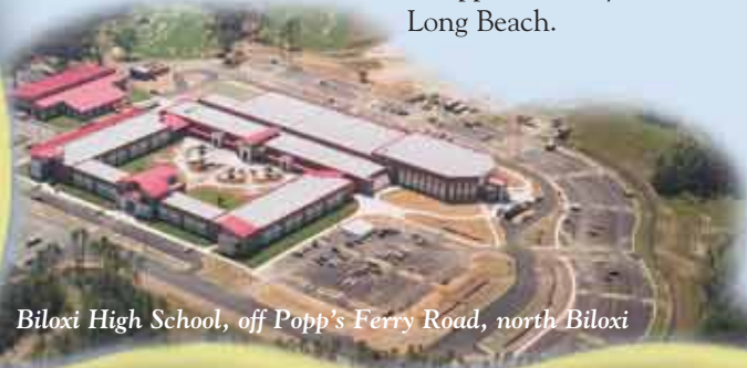
Biloxi High School, off Popp's Ferry Road, north Biloxi