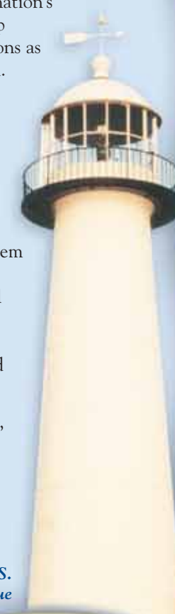
The Biloxi Lighthouse, at U.S. Highway 90 and Porter Avenue