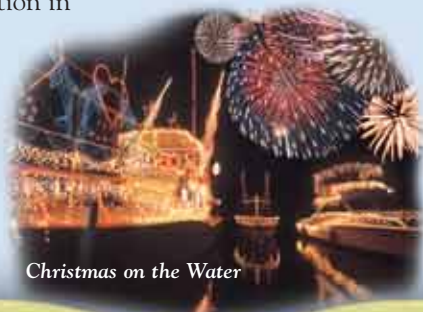
Christmas on the Water