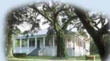
Beauvoir, the Jefferson Davis Home and Presidential Library

Ohr-O'Keefe Museum of Art , downtown Biloxi: Home to the "Mad Potter of Biloxi," this museum houses the world's largest public display of the works of potter George Ohr, an eccentric turn-of-the-century potter whose work has gained national acclaim.