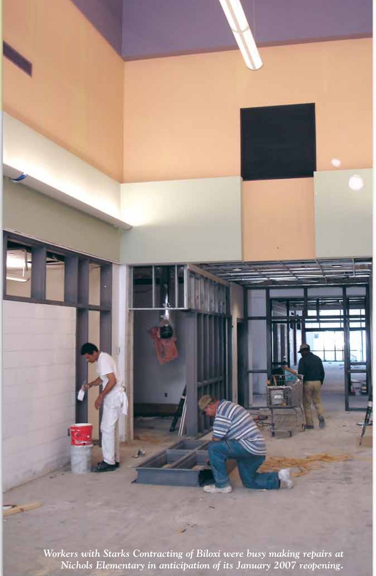
Workers with Starks Contracting of Biloxi were busy making repairs at Nichols Elementary in anticipation of its January 2007 reopening.

Finally, a word of thanks to the volunteers who have helped us in our recovery, to city officials who supported our effort to reopen the schools as soon as possible, and to school trustees and staff who offered their hearts and hands to help others in our community at a most difficult time. We are grateful.