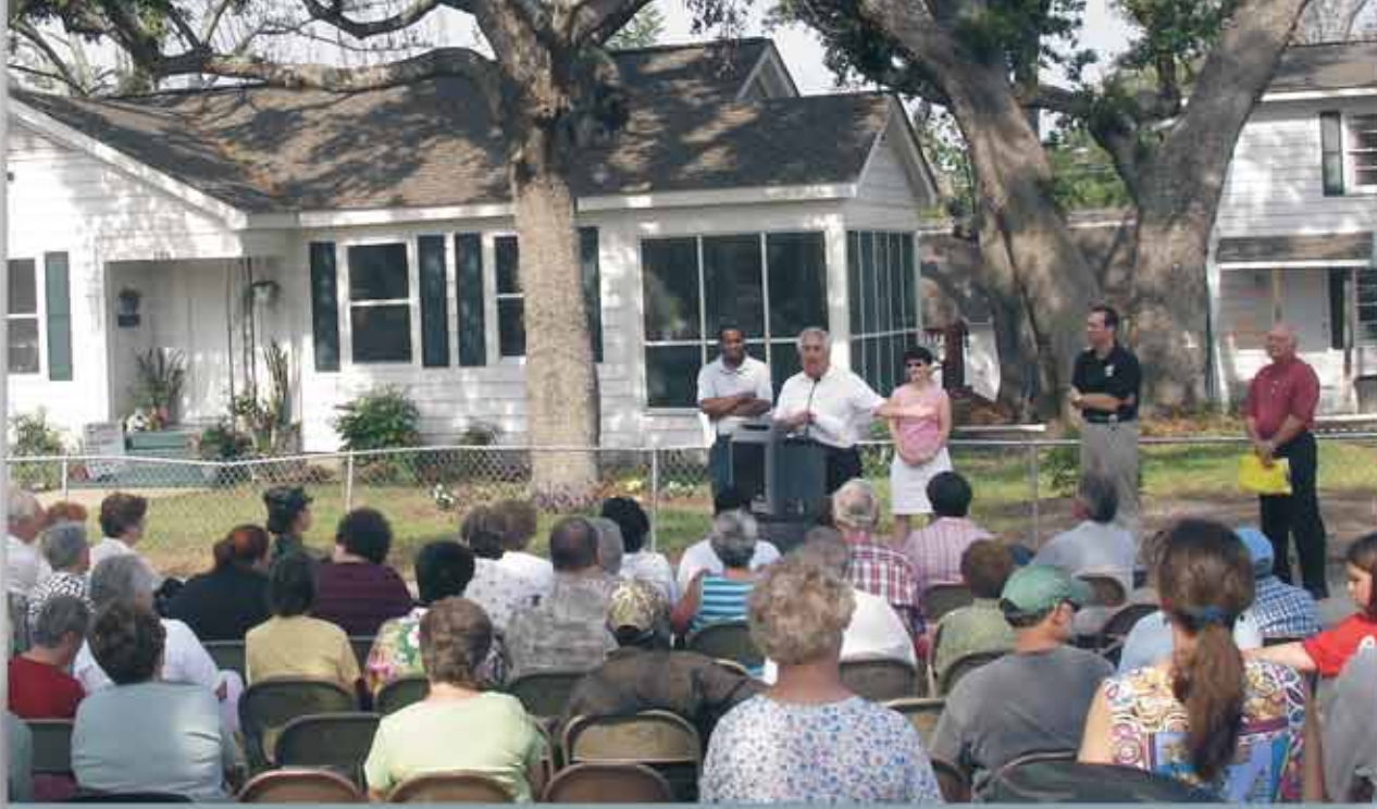
Hundreds of Biloxians gathered on Strangi Street in east Biloxi on June 1 for a "Welcome Home to East Biloxi" celebration where 11 east Biloxi families became the first of nearly two dozen families to be officially welcomed into homes that were restored by hundreds of volunteers from Habitat for Humanity of Northern Virginia. The Arlington-based Habitat group and Lord of Life Lutheran Church led a relief team to Biloxi on Sept. 8, days after Katrina devastated the city. In their first month, the volunteers operated a free clinic and distribution point at Bethel Lutheran Church on Pass Road. Volunteers soon began concentrating efforts in east Biloxi, where more than a hundred workers "mucked out" nearly two dozen homes by day and slept in temporary quarters at Bethel Lutheran by night. Mayor A.J. Holloway and Councilmembers George Lawrence and Bill Stallworth all thanked the volunteers for helping Biloxi with one of its most difficult issues – providing affordable housing.