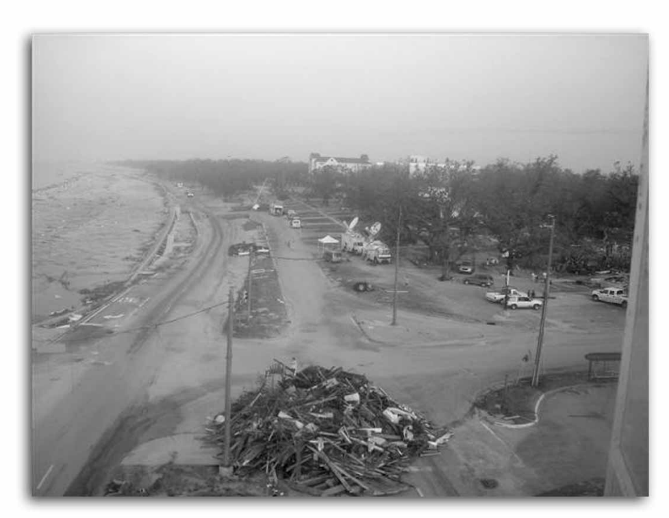
Workers had cleared sections of U.S. 90, as seen from atop the Biloxi Lighthouse.

Hundreds of workers, using dozens of pieces of heavy equipment and more than 300 dump trucks, are working 12-hour days, seven days a week to move debris from along city streets and major thoroughfares.